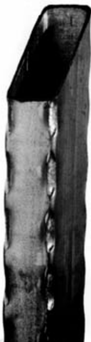
Ref.26-01 30x20 mm Alt. 3.000 mm Ref.26-02 40x20 mm Alt. 3.000 mm Ref.26-03 40x30 mm Alt. 3.000 mm Ref.26-04 50x30 mm Alt. 3.000 mm Ref.26-05 50x40 mm Alt. 3.000 mm